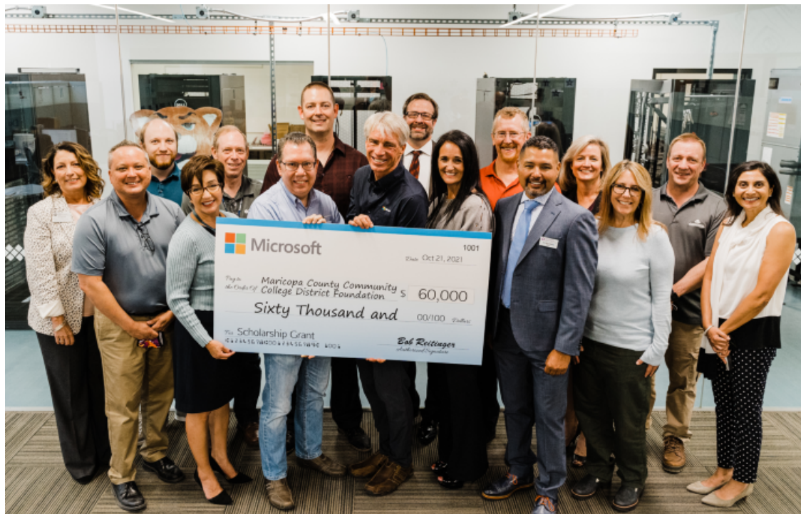
Microsoft Assists Scholars Pursuing IT Sector Careers